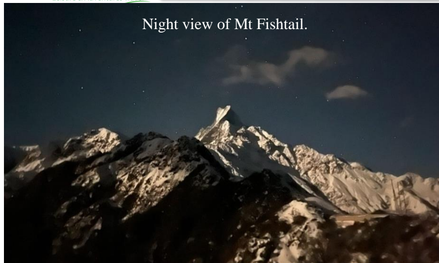
Night view of Mt Fishtail.

111 North Bridge Road #05-31 Peninsula Plaza, Singapore 179098 Tel: +65 69805801 email: info@brothersadventures.com Website: www.brothersadventures.com